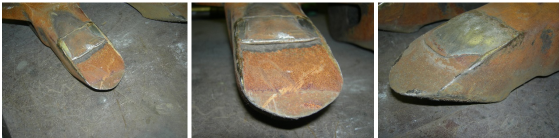
Fig. 5. Change of the anchor wear

After restoration and hardening, the nature of the wear process changes (Fig. 5). The wear rate of the front part is reduced, while ensuring the implementation of the “self-sharpening” effect. This leads to a decrease in the resistivity of the working body.