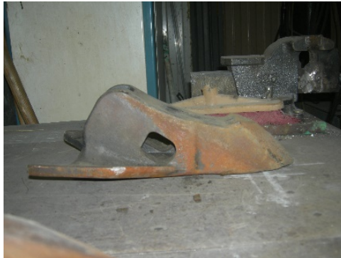
Fig. 8. View of the extremely worn-out anchor that cannot be restored

mass of the side surfaces of the anchor and its “wings”. The remains of a previously restored and strengthened surface are seen in Fig. 8. In this case, the loosening process is completely disrupted.