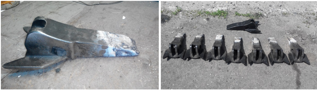
Fig. 4. Anchor after the first restoration and complete set of anchors

After restoration and hardening, the nature of the wear process changes (Fig. 5). The wear rate of the front part is reduced, while ensuring the implementation of the “self-sharpening” effect. This leads to a decrease in the resistivity of the working body.