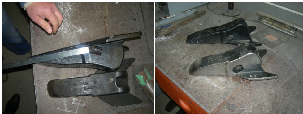
Fig. 2. View of the new and worn-out anchor

The main technological parameter for surfacing is the current strength. Experimental studies have shown that in the range of 90-120 A, recommended by the manufacturer of the surfacing material, a current of 110 A is optimal. In this case, the part does not overheat and the spray loss (lack of penetration) is minimal (Table 1). The choice was made according to the heating temperature and the output of the surfacing material (mass of wire before surfacing / mass of metal deposited on the part * 100 % = loss of material in %).