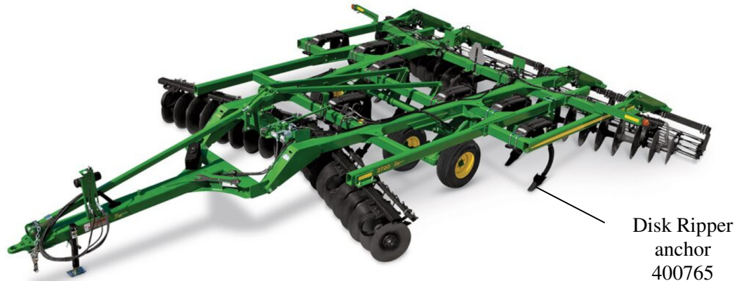
Fig.1. John Deere 512 Disk Ripper with anchor arrangement

The Ripper 512 design provides increased reliability by providing a high level of maintainability. This is manifested in the replacement of a quick-wear element-the anchor (tip), and not the entire rack. It is supplied by the dealer as spare part with high added value. However, their resource is not increased, and manufacturers do not provide measures to improve wear resistance. The resource is provided by the structural material-high-strength cast iron, from which the tip is made by casting. A number of studies have been conducted to assess the possibility of carrying out renovation activities.