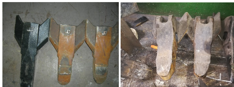
Fig. 7. View of worn anchors after the second and third restoration

However, the feasibility of recovery is lost when weight wear is 28-32 % of the weight of the new anchor. This is due to the wear not of the front surface of cutting and crumbling, but to the loss of