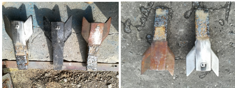
Fig. 6. View of the anchor after the second and third restoration

During the development of the technological process, the possibility of re-restoration of the anchor surface was checked. The difference between the technological process for the second and third surface restoration is the amount of the applied surfacing material. At the third restoration, it is 3-5 % more (Fig.6). It was found that the cutting surface of the anchor after the third restoration wears out 1.15 times slower than the anchor after the second restoration (Fig. 7). This is due to metallurgical processes during repeated surfacing.